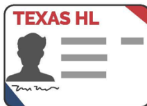
Texas Handgun License