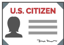
US Citizenship Certificate with photo