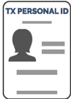
Texas Personal ID Card