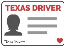
Texas Drivers License