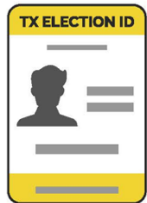
Texas Election ID Certificate