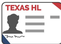
Texas Handgun License