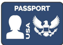
US Passport (book or card)